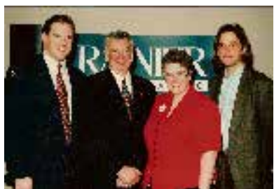
Governor Mike Lowry with sponsors at the Seattle Art Museum awards ceremony in 1996.