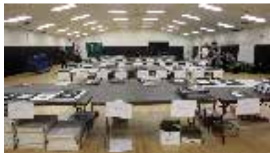
In 2014, our volunteer staff processed 4,100 entries from 70 high schools in a single day. That's a lot of work, buster!