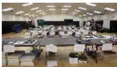
In 2016, our volunteers processed and sorted 3,741 entries from 62 high schools in a single day. That's a lot of work, buster!