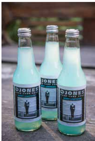
Jones Soda selects six images from our exhibit each year and features them on 250,000 bottles of their soda.