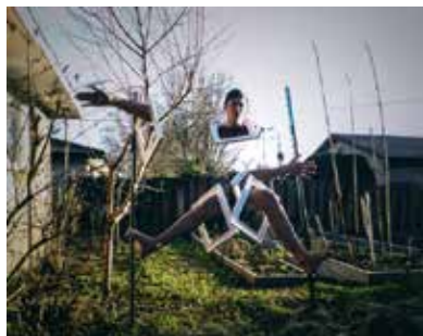
Ferris High School 3rd place MANIPULATION

A photograph of a person or group of people.