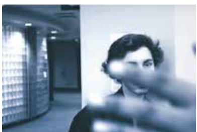
Skyview H.S.(Vancouver) 2nd place PEOPLE