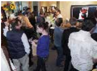
Museum Quality Framing hosts a huge crowd on opening night. Guests enjoyed refreshments compliments of Jones Soda.