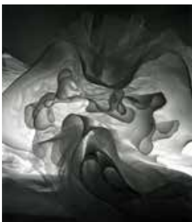
Olympia H.S. 2012 Best in Show