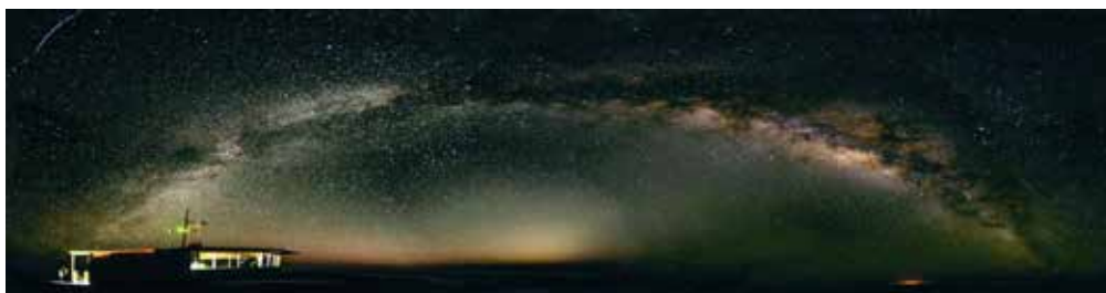
2nd place LANDSCAPE

Visit www.kenmorecamera.com to see exhibits from 2009 - present on-line.