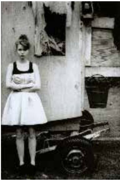
Bothell H.S. 2011 Best in Show